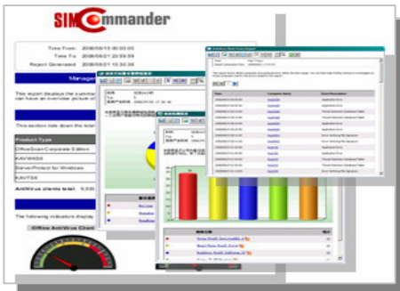
Rich Report Types